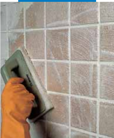
Finishing of single fired tile wall with a Scotch-Brite® pad