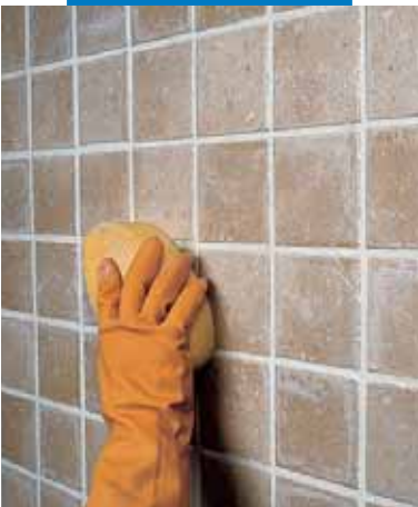
Finishing of single fired tile wall with a sponge