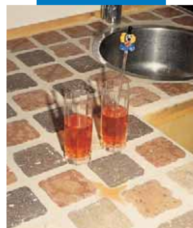
An example of a bonded and grouted kitchen worktop