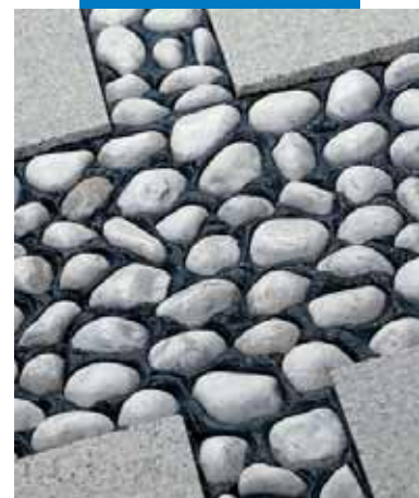
An example of grouted ornamental stones