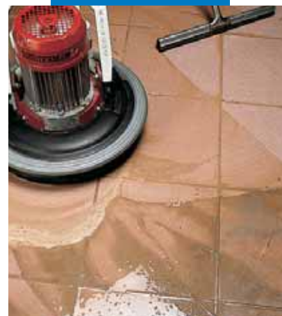
Finishing a porcelain tiled floor with single-brushed power float or rubber squeegee