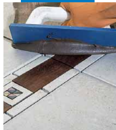
Grouting a ceramic tile floor with wood inlays with a trowel