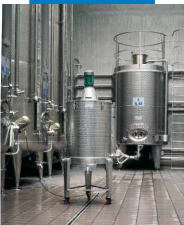
An example of a grouted wine cellar floor