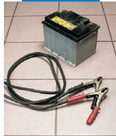
An example of a grouted battery room

4 days. Surfaces can also undergo chemical attack after 4 days.