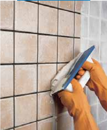
Grouting of single fired tile wall with a float