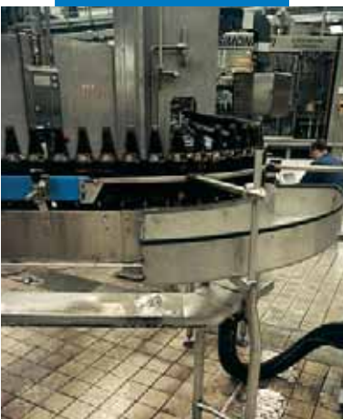
An example of a grouted brewery floor