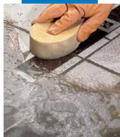
Finishing a ceramic tile floor with wood inlays with a sponge